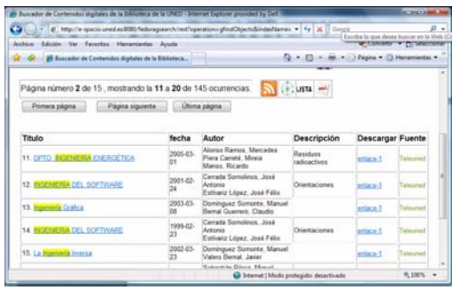
Figure 4. Results page due a query.

Given the widespread use of UNED digital journals, they take a leading role with access through direct links to its own page, where everyone of them can be introduced, being possible the access to the published issues. An outstanding news and additional features in recent days can also be viewed. When a query is made, the answer is returned in the same dynamic environment, providing a list of matches to their criteria, as shown in Figure 4. Search terms are marked in yellow in the list box provides the information of the loading date of the document along with the author and the description of the digital object type. Two more fields shall also be included, which respectively provide the link to download the document and the value of the source or collection that the digital object belongs to.