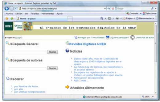
Figure 3 - User interface in eSpacio-UNED - Access homepage

The institutional repository, eSpacio-UNED, provides access and offers its services through the web page address <a href="http://e-spacio.uned.es/">http://e-spacio.uned.es/</a>. The homepage access of the repository has a functional aspect, as shown in Figure 3. At the same, there are several areas in which it stresses the header consists of external links. It has left the means of desk research, either generally or specifically by author. It also allows through additional links, access to other types of searches including those advanced by multiple search fields.